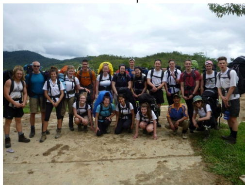
PHOTO: BHSSC World Challenge Team, Borneo. 2012